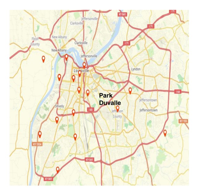
Figure 1. Geographic distribution of caregivers surveyed.